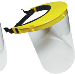
MU-16603: Pink, White, Yellow