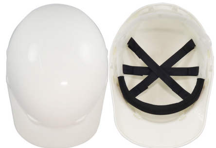
*6-Point Nylon Suspension (Pin-lock)