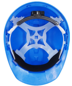
*4-Point PE Suspension (Pin-lock)