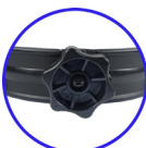
Knob Ratchet Type