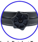
Knob Ratchet Type