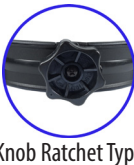
Knob Ratchet Type