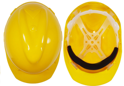
*4-Point PE Suspension (Pin-lock)