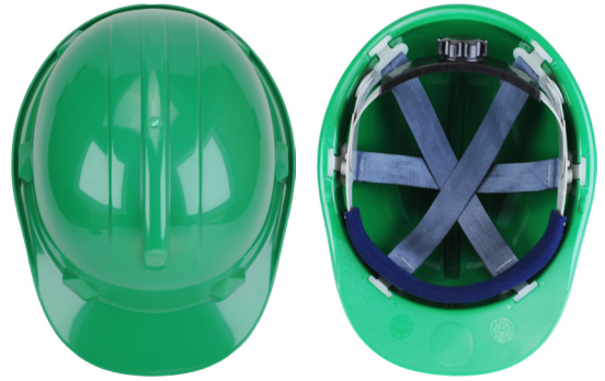
*6-Point Nylon Suspension (Ratchet)