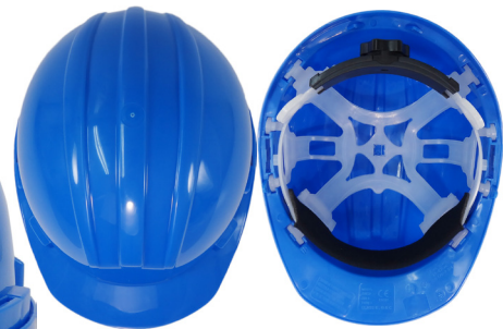
*6-Point PE Suspension (Ratchet)