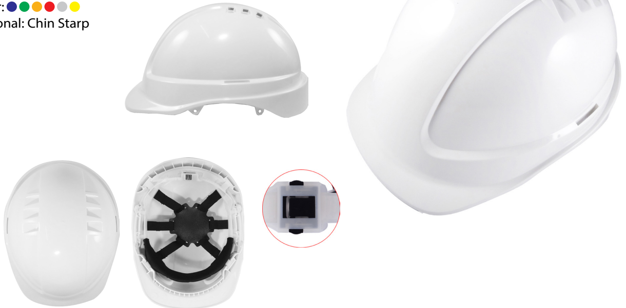
*6-Point Nylon Suspension (Push button)