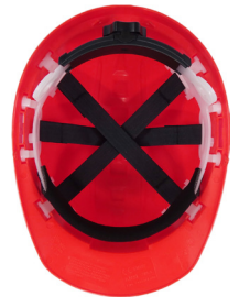
*6-Point Nylon Suspension (Ratchet)