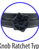
Knob Ratchet Type