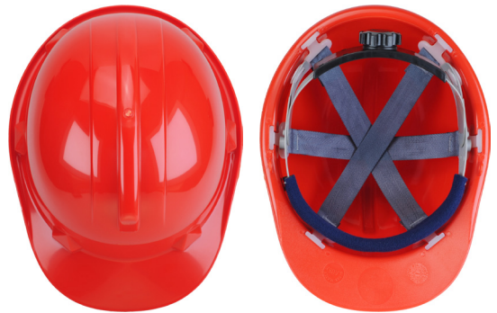
*6-Point Nylon Suspension (Ratchet)