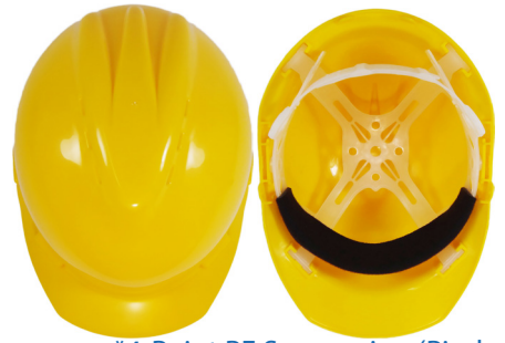
*4-Point PE Suspension (Pin-lock)