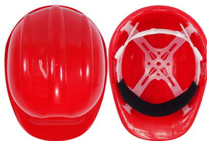
*4-Point PE Suspension (Pin-lock)