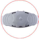
Knob Ratchet Type