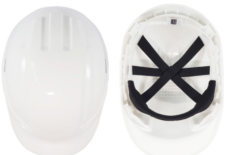
*6-Point Nylon Suspension (Push button)