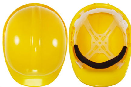
*4-Point PE Suspension (Pin-lock)