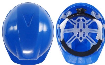
*6-Point PE Suspension (Ratchet)