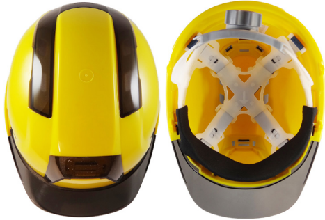
*4-Point Nylon Suspension (Ratchet)