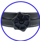
Knob Ratchet Type