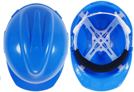
*4-Point PE Suspension (Pin-lock)