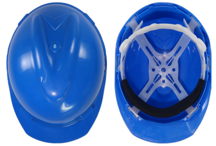
*4-Point PE Suspension (Pin-lock)