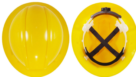
*4-Point Nylon Suspension (Ratchet)