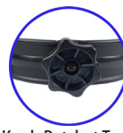
Knob Ratchet Type