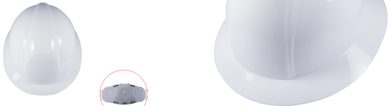
Knob Ratchet Type