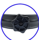
Knob Ratchet Type