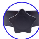
Knob Ratchet Type