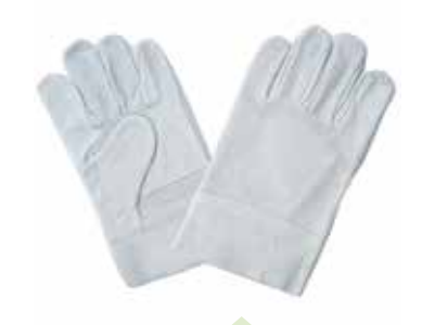
10.5" cow split leather welding glove. Natural with reinforce palm. No lining. A/B, B or B/C grade.