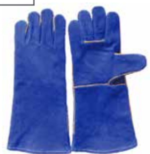
*14 inch Blue cow split leather welding gloves *Blue cow split leather welding gloves *golden yellow half welted seam *Full lining, One piece back *Self leather binding *A grade, AB grade, BC grade *Size available: 14"/16"/18"