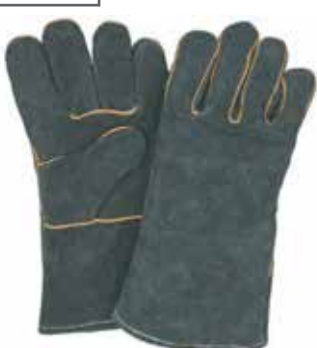
Cow split leather welding glove. Full palm. One piece back, Welt seam. Full lining. Size: 14" ,16" Color: Different color available. A/B,B or B/C grade.