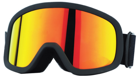
MU-63112 Suitable for kids

Frame: Black & Single layer 12mm foam Lens: PC Smoke - Double lens(Anti-fog inner lens) Strap: Single layer woven strap & 2 buckles