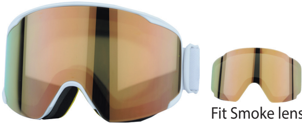
MU-63113 Replaceable strap Magnetic interchangeable lens

Frame: Black & Single layer 12mm foam Lens: PC Smoke - Single lens (Anti-fog) Strap: Single layer woven strap & 2 buckles