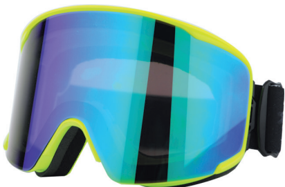
MU-63107 Replaceable strap

Frame: Frameless & Single layer 12mm foam Lens: PC Smoke - Single lens (Anti-fog) Strap: Single layer woven strap & 2 buckles