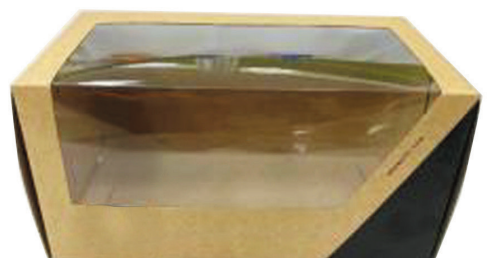
MU-63601 Color Box